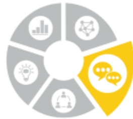
Foundations of Community Engagement