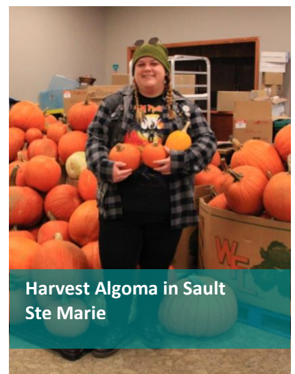
Harvest Algoma in Sault Ste Marie

While we know that climate change will have an impact on food systems, there is a lack of understanding around of specific health risks that this will pose in Canada . The impacts of climate change on food security are complex; however, we know that increased food insecurity will have a greater impact on vulnerable populations leading to worsened health outcomes. Meanwhile, ensuring sufficient access to affordable, nutritious and culturally appropriate food can be done in a way that is consistent with climate mitigation efforts, as food production and food waste are large sources of carbon emissions.