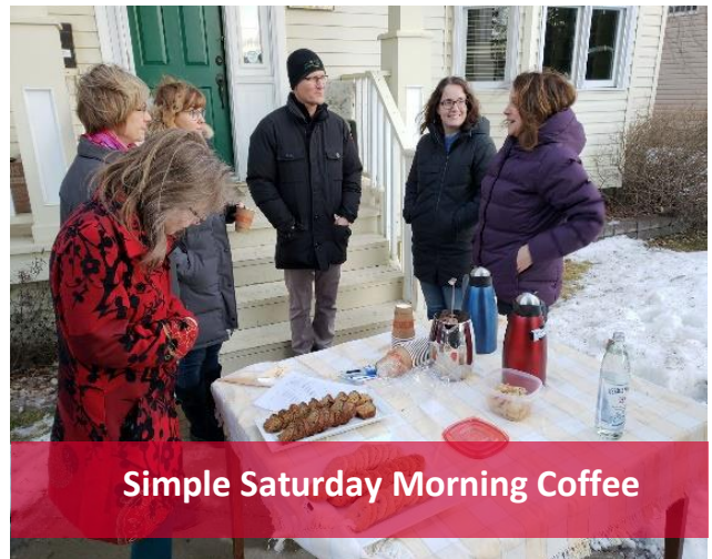
Simple Saturday Morning Coffee