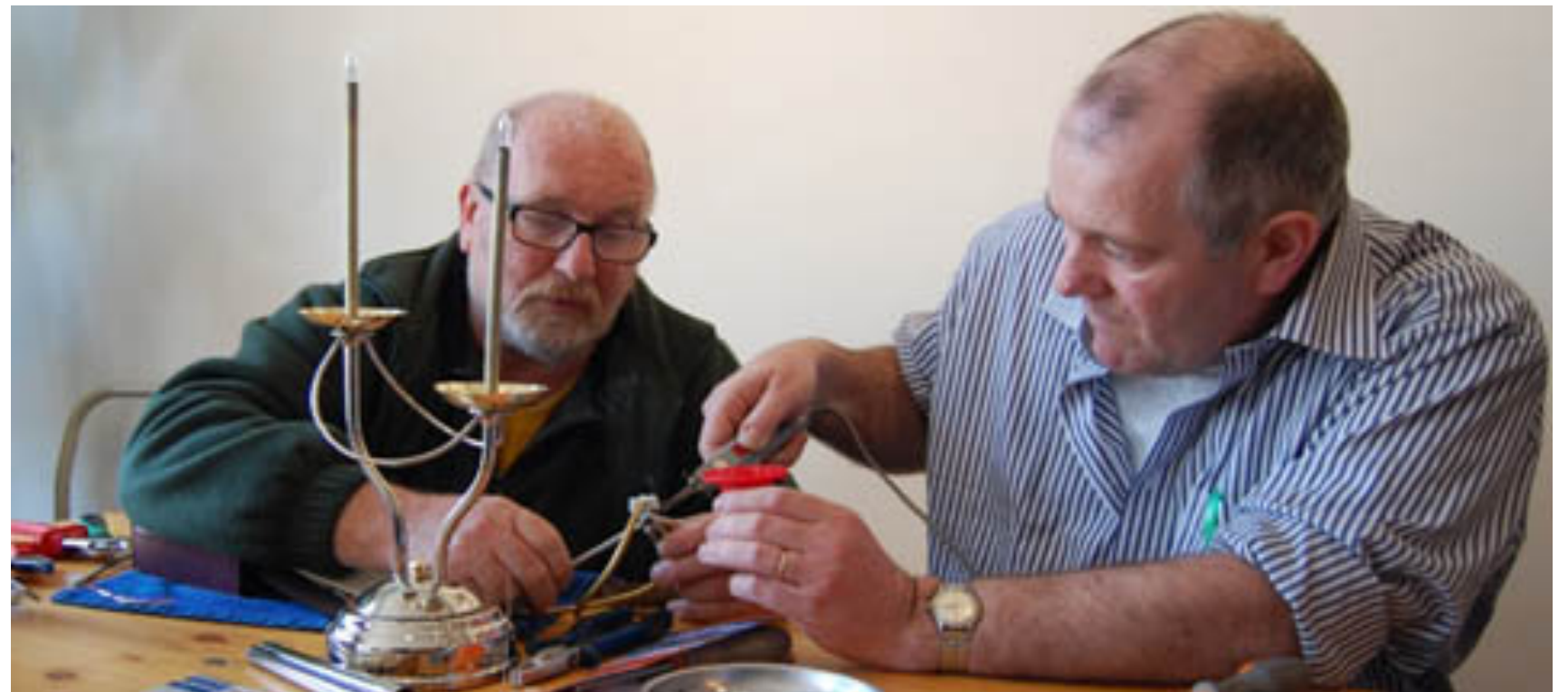
➤ Repair Cafe