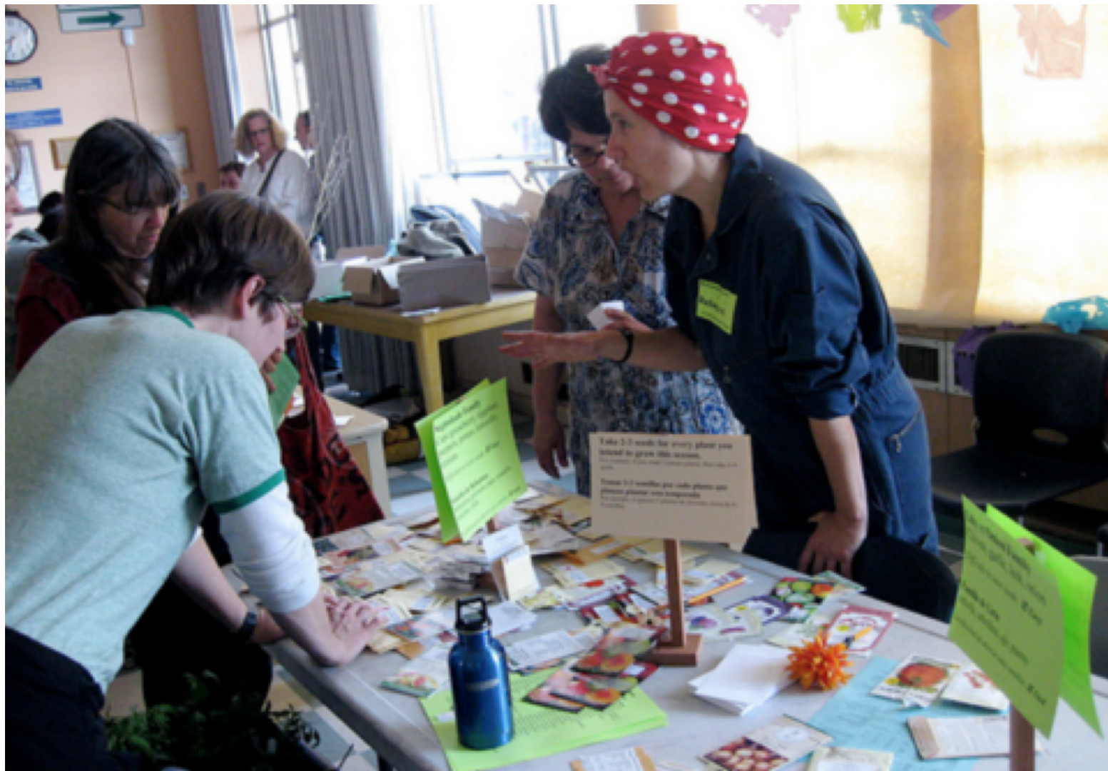
➤ Seed Swap