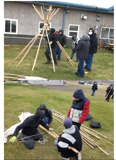
Roving Campus Dakota Tipi Class