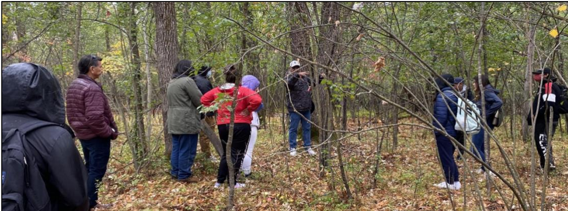
Roving Campus Students on a Community Tour

One of the most powerful – and sustainable – features of the design for the Roving Campus...and its view of the entire community as its “classroom” is the participation and partnerships it has fostered with a diverse list of community partners throughout Portage La Prairie and Manitoba. This list of partners and their contributions to the success of the Roving Campus is also a beautiful illustration of the old adage “it takes a village to raise a child.” Below is a short list of some of the organizations that have contributed to the curriculum for the Roving Campus: