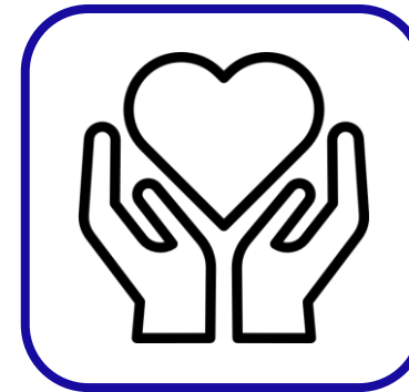
Holistic Health & Wellbeing