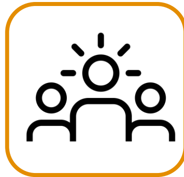
Youth Engagement and Leadership